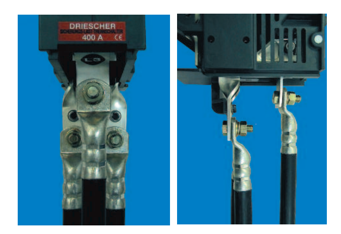
Pic. 7: Cable connection below

65 Nm) as well as loosening the cable, the screw head must be held with a tool.