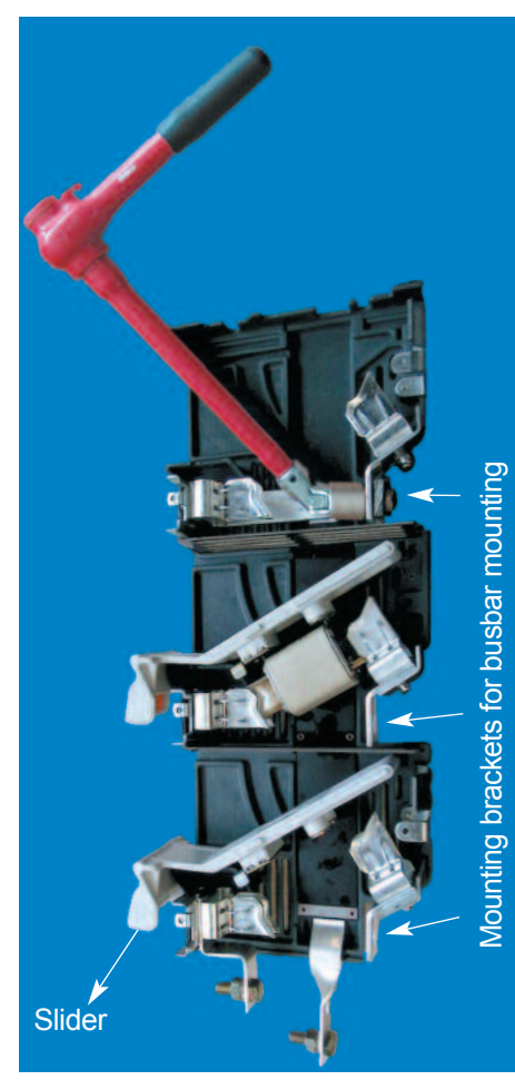
Pic 3: 403 system mounting situation on the busbar

For mounting necessary hexagonal nut, spring washer and flat washer must be attached on the connecting element fixed on the cardan-joint insert (see pic. 4), so that it can be accurately led while fixing on the connecting screw (M12).