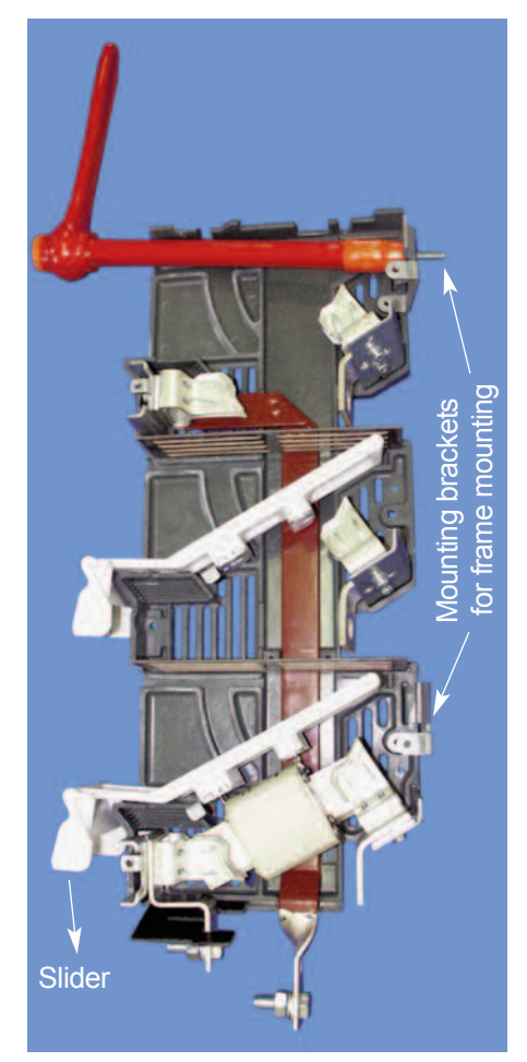
Pic. 1: 403 system mounting situation on a frame

The isulated socket spanner insert is additionally secured with a setscrew, so that the insert can not be removed unintentionally.