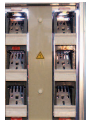
Pic 5: Busbar insulating cover

Pic 4: Insulating plug-in-lever with cardan-joint insert SW 19